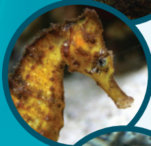
..... Seahorse (g)

(6) Catches slippery fish with its sharp pointed teeth.