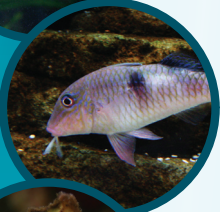
..... Goatfish (f)

(6) Catches slippery fish with its sharp pointed teeth.