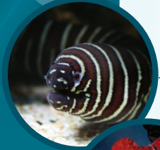
..... Zebra (a) Moray Eel

(1) Scrapes food from rocks with strong front teeth.