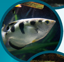
..... Archerfish (e)

(4) Slurps up small shrimps with a long snout.